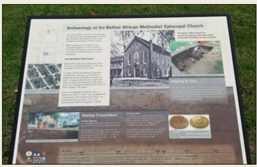
Bethel AME Church, Easton