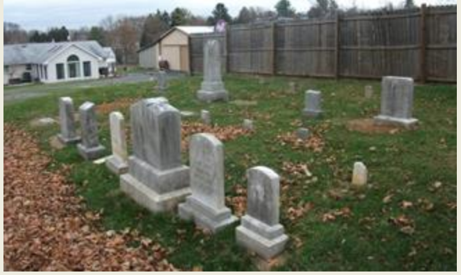
Tolson's Chapel, Sharpsburg