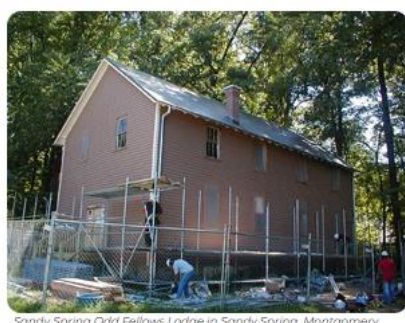
Sandy Spring Odd Fellows Lodge in Sandy Spring, Montgomery County.

program typically receives an annual appropriation of $5,000,000 for grants per year. Applications for the AAHPP are typically available in early April and due July 1, with decisions made by December every year.