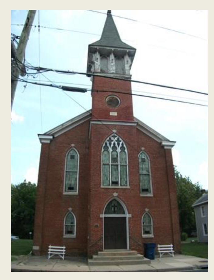
Asbury M.E. Church, Easton