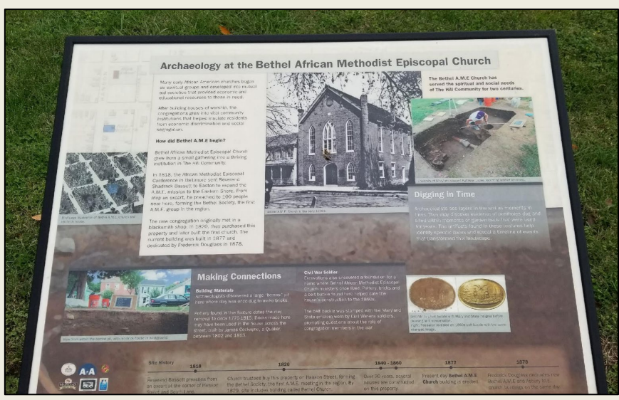
Bethel AME Church, Easton