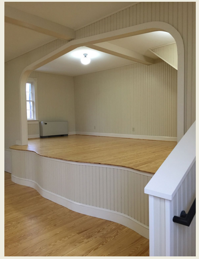
Your project must protect historic features.