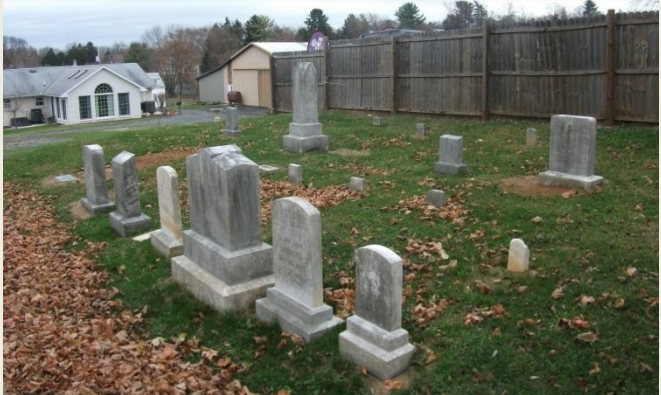
Tolson's Chapel, Sharpsburg