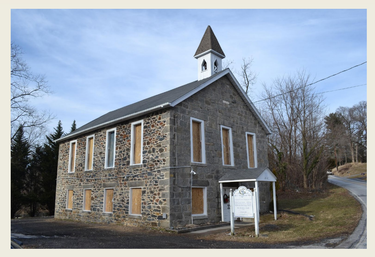
MHT will let grantees know if a preservation easement is required.