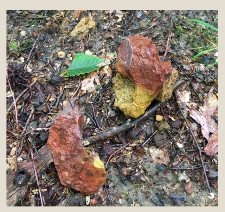
Iron Hill Cut Jasper Quarry Archaeological Preserve, Cecil County