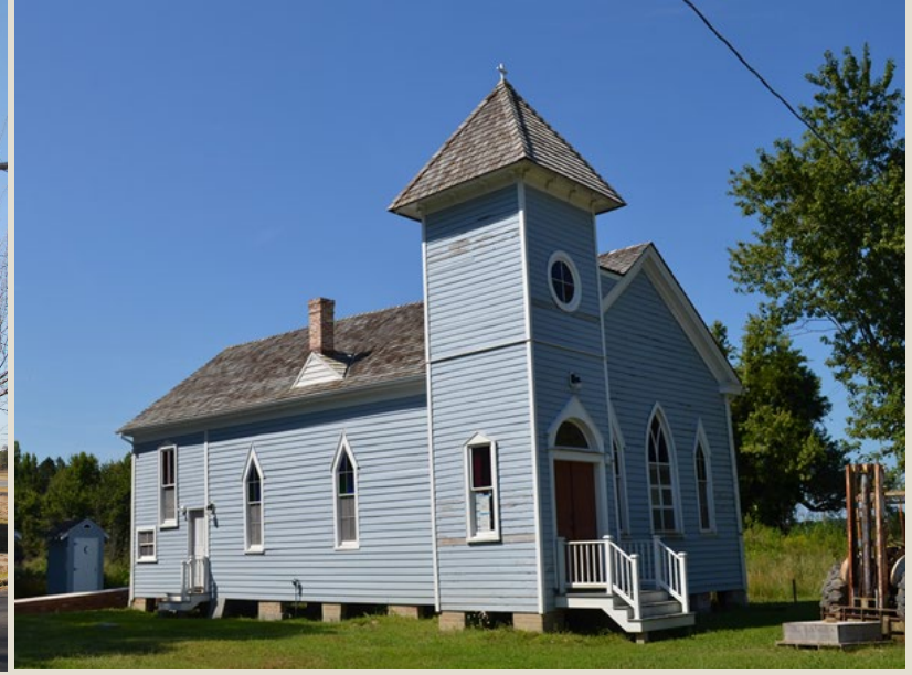
Christ Rock Church, Dorchester County