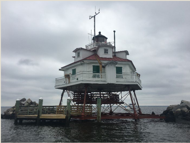
Thomas Point Shoal Lighthouse, Anne Arundel County