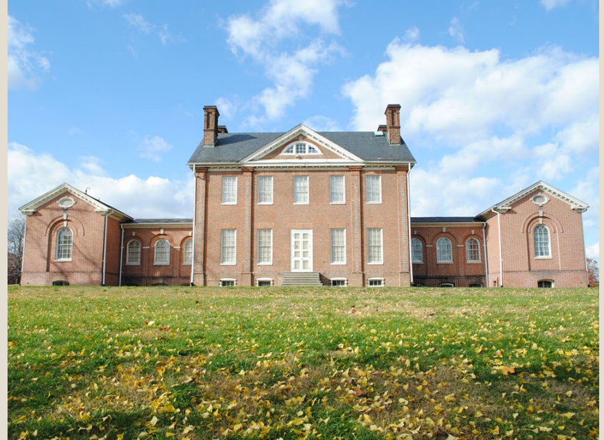
Mount Clare Museum, Baltimore City