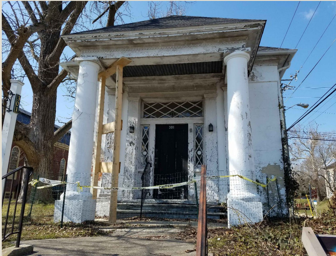
Wallace Office Building, Dorchester County

Program requires conveyance of an easement.