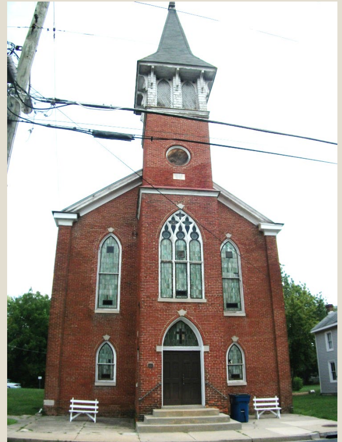
Asbury M.E. Church, Easton