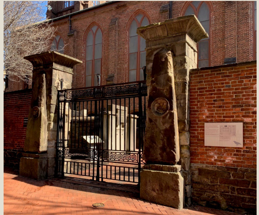
Westminster Cemetery, Baltimore City