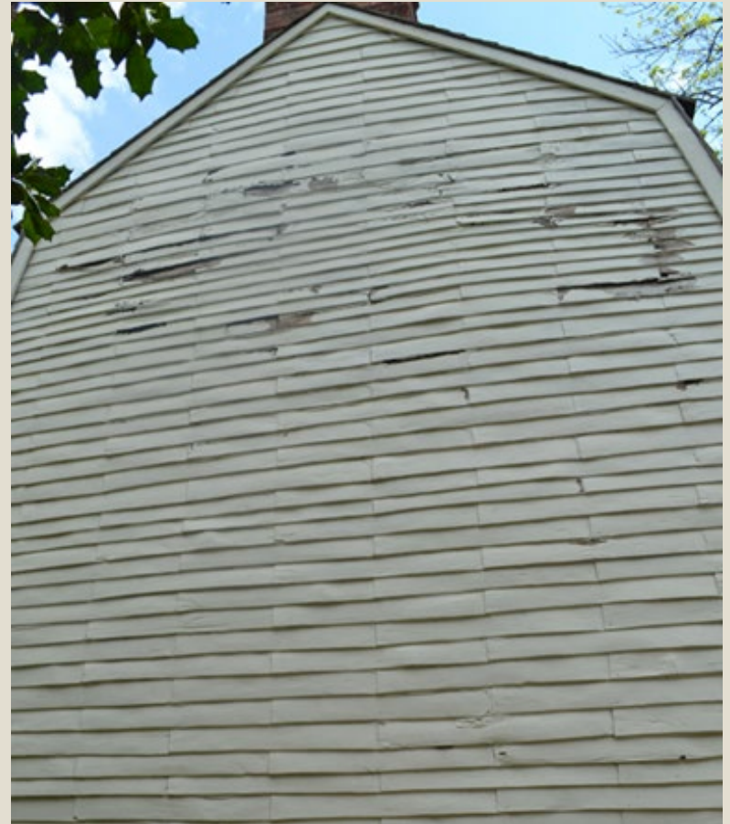
Hays House, Harford County