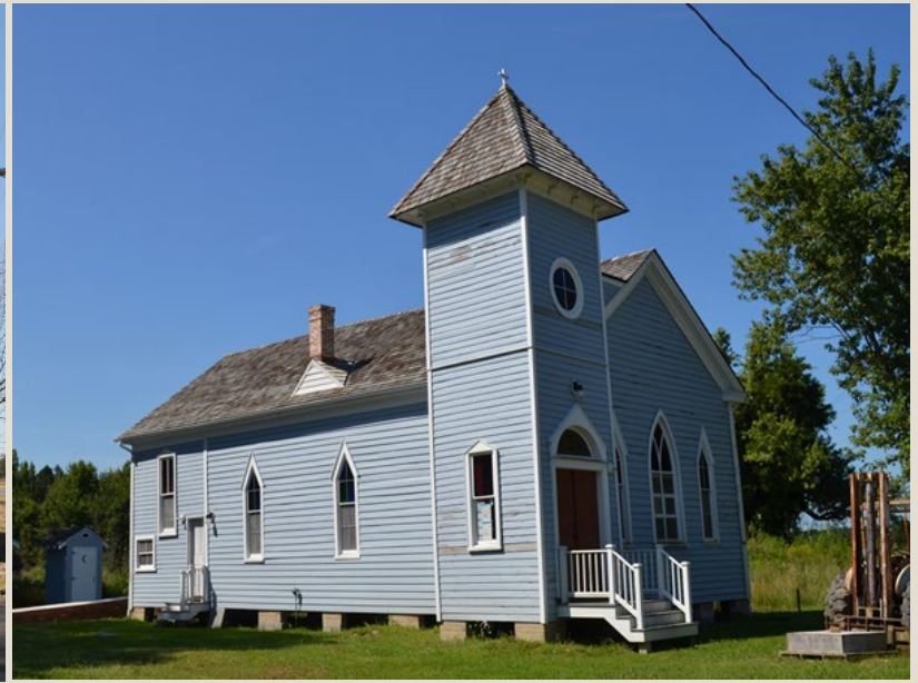
Christ Rock Church, Dorchester County