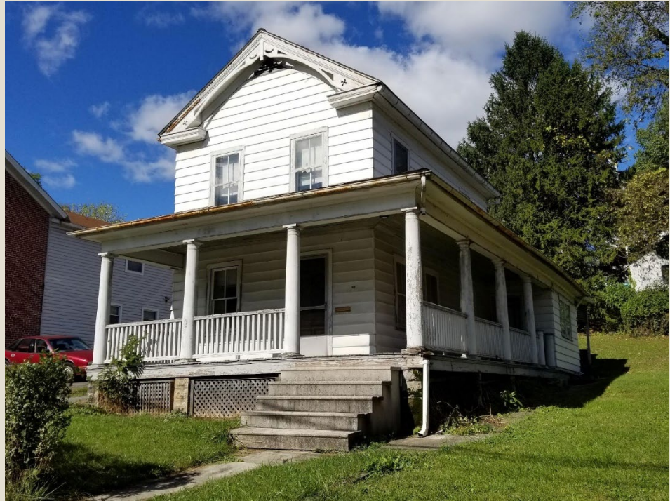
Jane Gates Heritage House, Allegany County