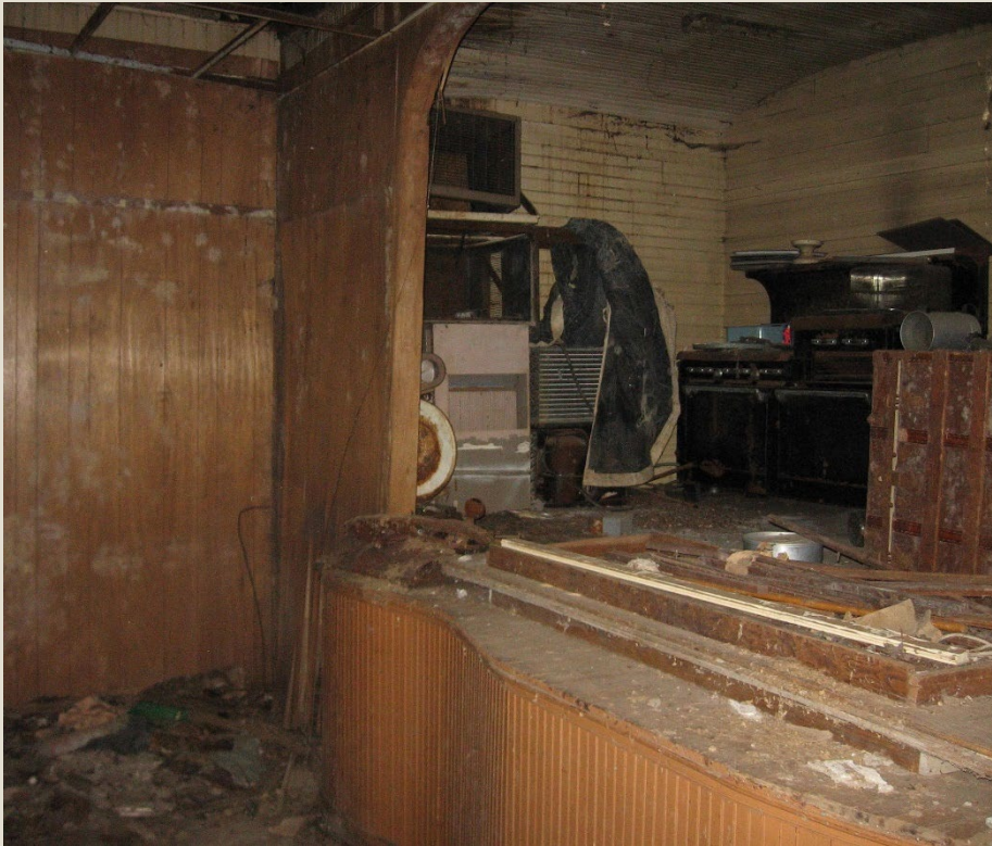
Sandy Spring Odd Fellows Lodge, Montgomery County