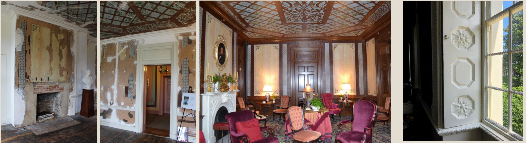
Clifton Mansion, Baltimore City + Hammond-Harwood House, Anne Arundel County

Construction work should emphasize protection of the property and/or repair of important original/historic features and materials