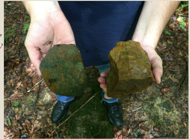
Iron Hill Cut Jasper Quarry Archaeological Preserve, Cecil County