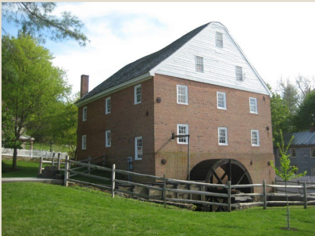
Union Mills Homestead, Shriver Grist Mill Flume, Carroll County