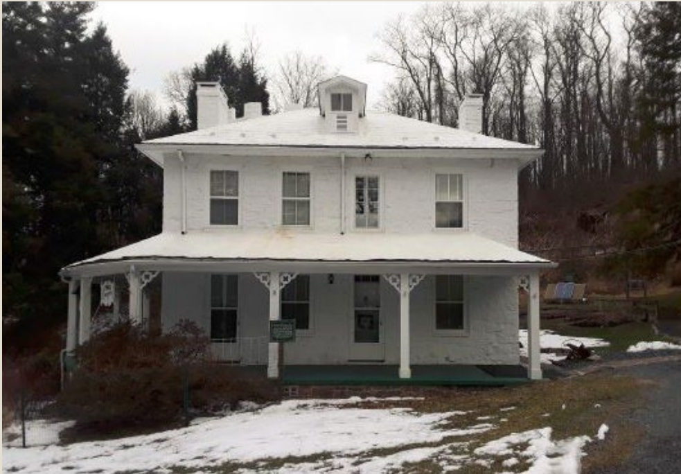
Evergreen House Museum, Allegany County