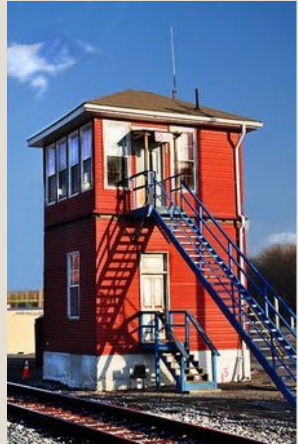
B&O WB Tower, Frederick County