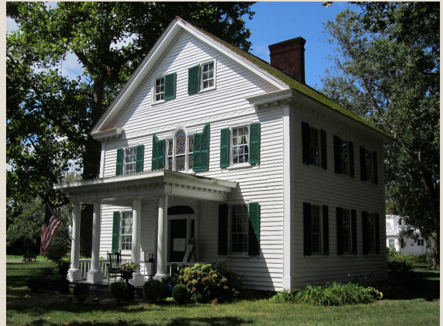
Calvin B. Taylor House, Worcester County