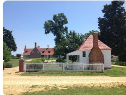
Sotterley Plantation gatehouse project.