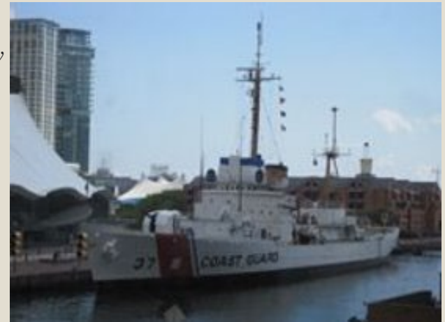
USCGC Taney, Baltimore City