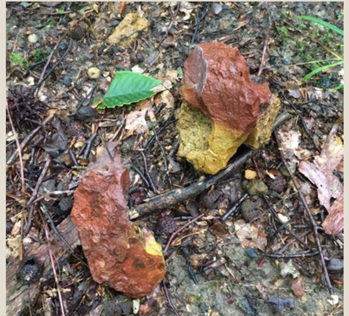
Iron Hill Cut Jasper Quarry Archaeological Preserve, Cecil County

The acquisition of the property should directly contribute to its preservation.