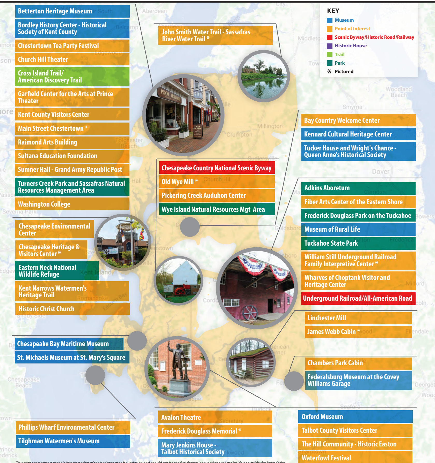
This map represents a graphic interpretation of the heritage area boundaries, and should not be used to determine whether sites are inside or outside the boundaries.

SPAN ACROSS KENT, QUEEN ANNE'S, CAROLINE, AND TALBOT COUNTIES